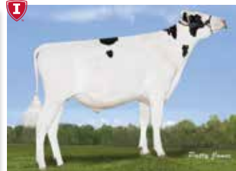
0200H011056 Claynook Fairview Duke x Silver