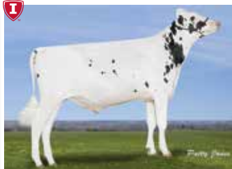
0200H010909 Progenesis Keystone Detour x Supershot