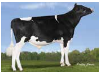
0200H010974 Ste Odile Electric Fedex x Supershot

More than ever, with shrinking margins on-farm, producers are looking for trouble-free cows that produce large volumes of milk and components. EastGen's PROFIT PLU$ line-up features sires that deliver these traits along with a high lifetime profitability and priced to suit your bottom line!