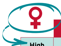
Table 1 - Disease Frequency by Immune Response Category

A number of large commercial herds were analyzed to assess the impact of female Immune Genomics on disease incidence. Mastitis, Lameness and Total disease frequency (any case of routinely recorded disease) were analyzed as the most prevalent and consistently well recorded traits