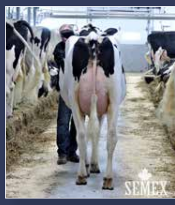
Milibro Denim Roselil VG-86-2YR