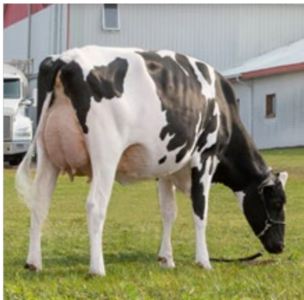
Lareleve Sidekick 772 VG-87-2YR

Taking the Holstein breeding world by storm, Walnutlawn Sidekick will continue to excite breeders with his unrivalled type profile. Still Canada's #1 Conformation sire and #1 Mammary System sire with +19 and +17 respectively, Sidekick added enough daughters to gain an official GLPI proof of 3277. Although Sidekick can be seen as a elite type specialist, he is also a tremendous source for component rich milk (+0.64% Fat, +0.31% Protein). Currently on 577 daughters, the Breeder's Edge designated Sidekick is 94% GP or Better and has an amazing 31% VG-2YR-Olds. He is destined to leave an impact for years to come with his eye-catching progeny including his exciting sons Sideroad,