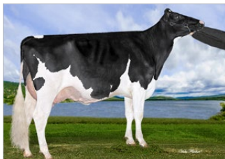
Medalist's Dam (by Sidekick): Tappenvale Miss Universe VG-85-2YR-CAN

* - Available as conventional and Pre-Purchase Only Sexed