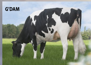
De Oosterhof Dg Rose VG-89, EX-90 MS