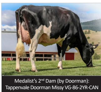
Medalist's 2nd Dam (by Doorman): Tappenvale Doorman Missy VG-86-2YR-CAN