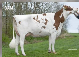
Lakeside Ups Red Range VG-85-NLD

* - Available Pre-Purchase Only Sexed (Limited Supply)