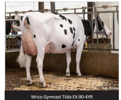
Wrico Gymnast Tilda EX-90-4YR

Gymnast , a Doorsopen from the time-tested Atlee-Adeen-Ada family, will continue to resonate with breeders as a high reliability, elite production sire with positive deviations, solid +7 Conformation, and desirable overall Health & Fertility Improvement (+561).