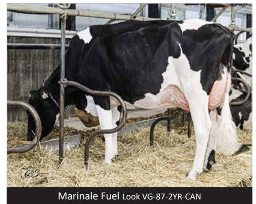
Marinal Fuel Look VG-87-2YR-CAN

GLPI, he holds down the #2 proven Immunity+ ® spot. Stemming from five high-producing EX direct dams, Fuel is in a league of his own offering elite production and deviations from daughters that are built to complement many of today's common blood lines with well-attached udders (+10 Fore Attachment & Rear Attachment Width), ample Chest Width (+12), Body Depth (+12), correct F&L's (+6), and ideal rumps (+7 Rump, +4 Loin Strength, 5L Rump Angle, 7A Thurl Placement).