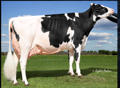
2nd Dam: Kings-Ransom MG Cleavage EX-95-5YR-USA (EX-97 MS)

Remarkable ALLEYOOP son from an 11th generation EX dam. This represents a modern-day incarnation of the greatest transmitting cow family ever the Roxy's! Corona's flawless breeding descends from a maternal line that has continued to exceed and excel generation after generation like no other.