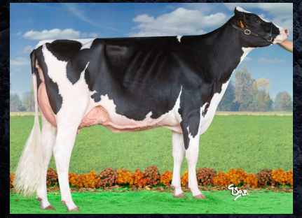
Dam: TOC-Farm Unix Alexi VG-89-ITA (EX MS)

From 12 generations of VG or EX's from the unparalleled Italian Amyly family 2007 & 2009 Italian National Champion and 2007 Holstein International World Champion.