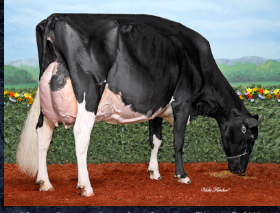
2<sup>nd</sup> Dam: Comestar Lamadona Doorman EX-94-2E-CAN 19*

From a VG-89 Impression daughter of the World-Famous Lamadona, a perennial All-Canadian & All-American nominee from the most impactful family in Holstein genetics worldwide over the past 35 years - the Laurie Sheiks!