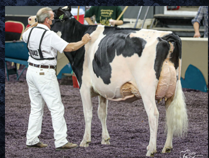
Dam: Ladyrose Caught Your Eye VG-89-2YR-USA

Delta-Lambda x Unix x Doorman Currently the #1 ranked Lambda son for type, BULLSEYE is from a performance-packed pedigree touted worldwide for uniquely producing many of the best-of-the-best brood cows of their day.