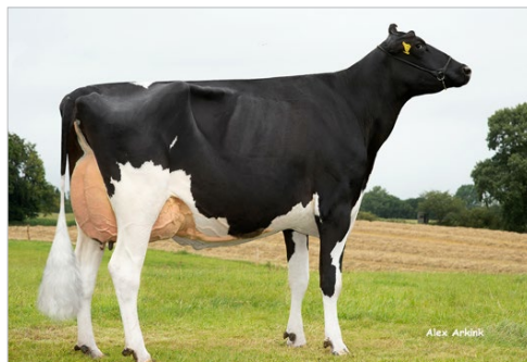
Dam of ALLGAUD: HAH Iwanka VG-89-4YR-DEU (by Boldi V Gymnast)

month since the last proof round. Stemming from five high-producing EX direct dams, Fuel is a perfect complement to many of today's common bloodlines as a source of elite production, and deviations from daughters that are built with well-attached udders (+10 Fore Attachment & Rear Attachment Width), ample Chest Width (+12), Body Depth (+12), correct F&L's (+5), and ideal Rumps (+8). The Premier Sire of the 2022 WDE and RAWF Croteau Lesperron Unix and his son Claynook Dealmaker both remain popular as conventional semen and on our Day-To-Day Sexed offerings. Dealmaker , with +15 for Mammary System, remains the #1 proven sire for udders in Canada while Unix continues to stake his claim as one of the true greats of all time! Unix has an unbelievable 20,000+ lactations reflected in his genetic evaluation, and on over 10,000 classified daughters he is an amazing 87% GP & Better with close to 200 EX and 3,500+ VG daughters to date! Both sires are available daily with conventional semen or on our Day-To-Day Sexed list and incredibly as part of our 30 for $25 Special! The A2A2 designated Boldi V Gymnast , continued to experience gains for all production traits to an impressive +2255 Milk, +85 Fat (-.01%), +90 Protein (+.11%) while holding for type at +7. In addition to Gymnast's profitable