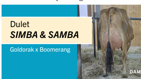
Dulet SIMBA & SAMBA

Coule Crest Carver remains our #1 Guernsey sire with +1233 LPI. We have added the Oceanbrae Foster (+1796 GLPI) to our MS list. Additionally, Foster is the #2 Conformation sire (+11). We are able to offer the #1 genomic sire Oceanbrae Generator as Pre-Purchase Sexed .