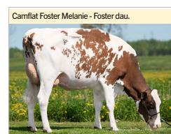
Camflat Foster Melanie - Foster dau.