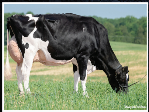
DULET D-LAMBDA KATRINA EX-90-5YR-CAN 6*

Conventional and Sexed Embryos available from these families plus more!