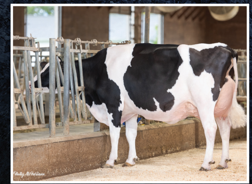
MYSTIQUE LAMBDA ANIS EX-93-2E-CAN 9*