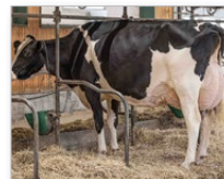
2nd Dam - 'Lambda Briar'

Jacobs BLURRY-P: This is a truly exciting Leyhigh-PP son from a VG-1YR daughter of ' Lambda Briar ' brood cow extraordinaire from the breeding juggernaut Ferme Jacobs! With Blurry-P you'll be introducing some elite-type Polled genes into your herd.