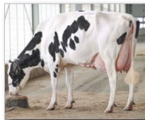
Dam - Comestar Hope Alligator EX-91

Comestar HONORIS: This Robot Ready and A2A2 Poprock son is from an EX-91 Alligator that stems from a different branch of the ' Laurie Sheik ' family which includes the well-respected ' Horizon Jasper '. Another Comestar sire made to deliver balanced breeding at its best!