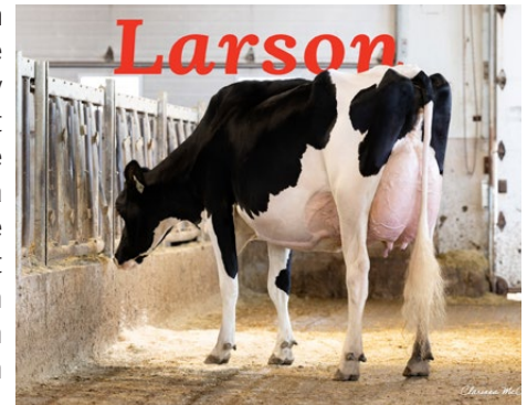
Progenesis Larson Kelley VG-88-3YR-CAN Dam of Progenis Klein and Progenis Kenzo

Cookiecutter Larson has quickly become a top choice, a highly reliable modern sire built for today's progressive operations. He delivers a strong production profile with +1434 Milk, +99 Fat (+.34%), and +58 Protein (+.07%). With more than double the daughters in his Conformation proof, he jumped 2 points to a solid +8! Larson , who is an A2A2 carrier, brings the complete package — Calving Ease , Fertility First® , Robot Ready™ , and A2A2 — making him a smart, profitable, well-balanced choice for breeders. Larson will be available conventionally or on a Pre-Purchase Sexed basis.