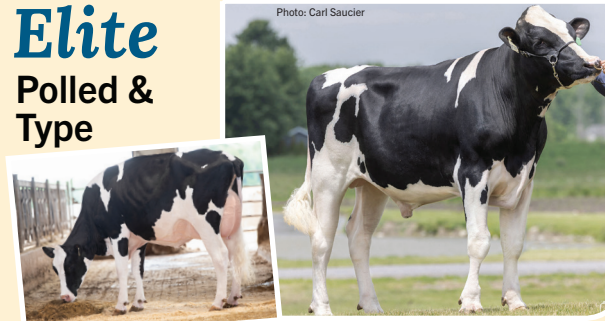
Dam: DREW HOLME CONWAY LEYSURE VG-88-3YR-CAN

PROGENESIS LEONARDO-P *RC You Pay $22 While supplies last!