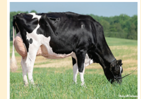
Dam: DULET D-LAMBDA KATRINA EX-90-5YR-CAN 5*

M/L +1434 F/G +67 (+0.08) P +55 (+0.05) Conf. +6