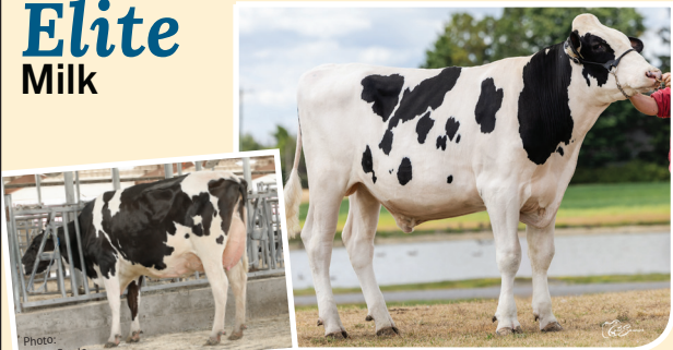
Dam: SIEMERS DRBO HANAN 39846 VG-86-2YR-USA

SIEMERS HUMPY-PP You Pay $27 While supplies last!