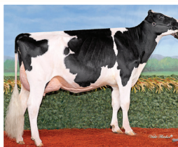
2 nd Dam: DREWHOLME LAMBDA LEYSURE P EX-92-5YR-CAN 5*

M/L +1423 F/G +62 (+0.06) P +40 (-0.06) Conf. +13