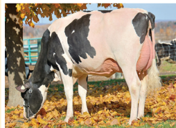
Dam: MYSTIQUE ALLIGATOR ALCATRAZ VG-86-2YR-CAN

M/L +1563 F/G +53 (-0.09) P +48 (-0.05) Conf. +15