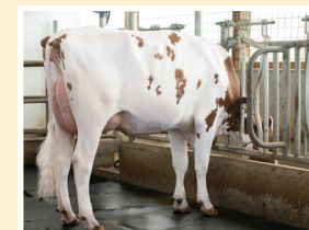
Dam: NORTH-POLLED RANGER MIRACLE P VG-87-3YR-CAN

M/L +952 F/G +63 (+0.21) P +49 (+0.12) Conf. +11