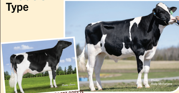
3 rd Dam: WALNUTLAWN ABBOTT BREEZE EX-91-3E-CAN 1*

WALNUTLAWN PG BERKLEY You Pay $27 While supplies last!