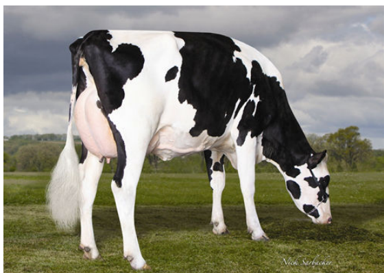
RICHMOND-FD S BARBARA FIFTH DAM