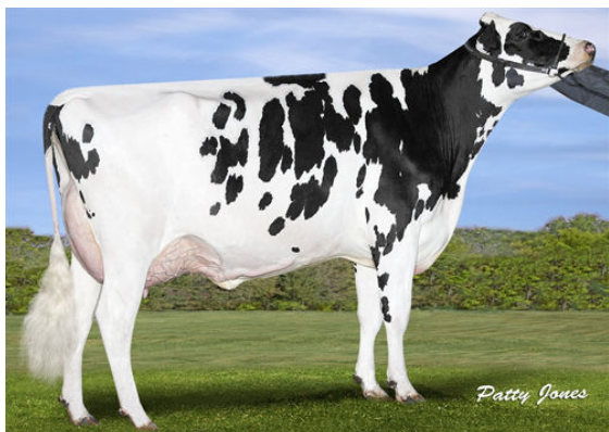
PROGENESIS EXACTLY BEST THIRD DAM