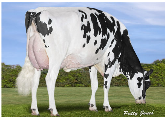
PROGENESIS EXACTLY BEST THIRD DAM