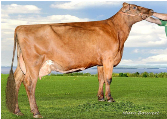
MARDEL OBLIQUE MIA-MI 28 DAM