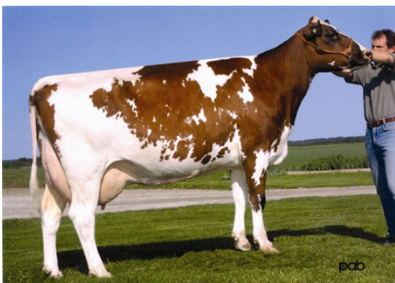
LACHUTE ROAD H S SALEM THIRD DAM