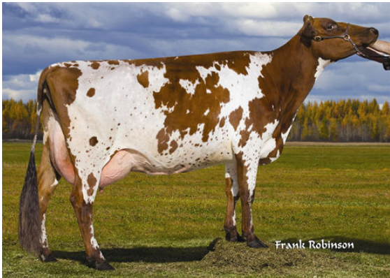
DUO STAR AMOUR GRANDDAM