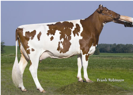
FAUCHER PETER LULABY FOURTH DAM