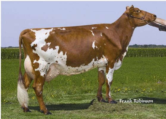
LA SAPINIERE FACY-B FOURTH DAM