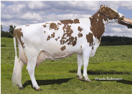
LA SAPINIERE FACY FIFTH DAM