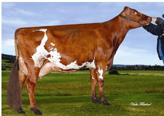
VISSERDALE SELENA 3 THIRD DAM