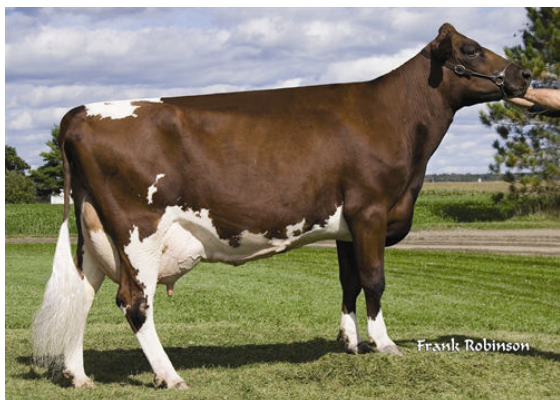
KILDARE PATSY B-JUSTICE FIFTH DAM