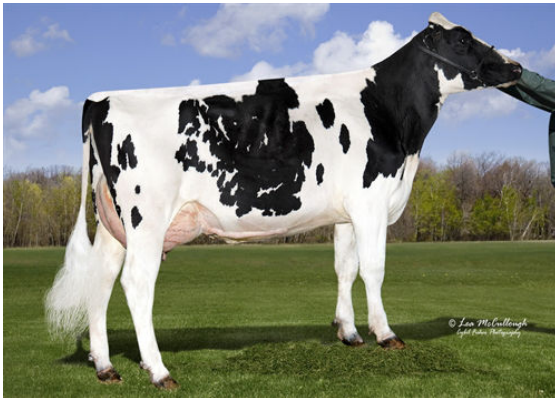
STRAUSSDALE ESCALADE 1584