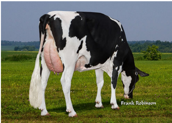
LORINDA ESCALADE 3198