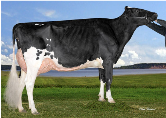
JACOBS DOORMAN BARCELONE DAUGHTER