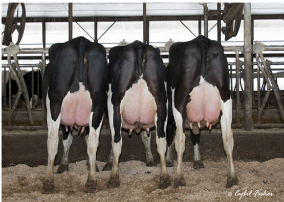
SUPERMAN DAUGHTER GROUP

L-R CURTIN SUPERMAN 20220, CURTIN SUPERMAN 20048, CURTIN SUPERMAN 20219