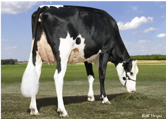
KHW SUPER ADERYN GRANDDAM