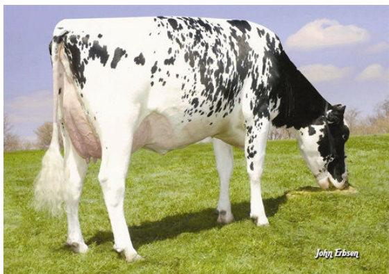
LARCREST COSMOPOLITAN FOURTH DAM