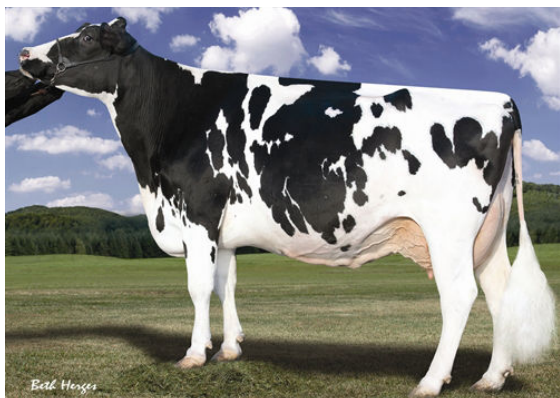
LARCREST OSIDE CHAMPAGNE-TW FIFTH DAM