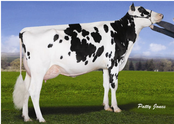
GILLETTE BOLTON 2ND LOOK FIFTH DAM