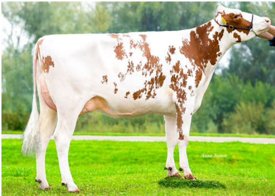
3STAR PATTY DAM