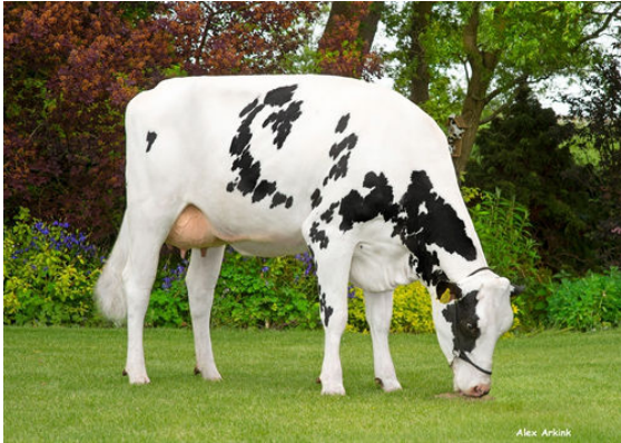
3STAR RT PATSY GRANDDAM