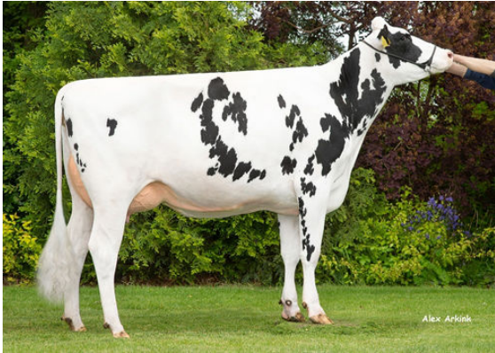
3STAR RT PATSY GRANDDAM