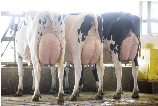
SIEMERS TRAJECTORY DAUGHTER GROUP

L-R SIEMERS TRJ BROOKE 28046, SIEMERS TRJ BROOKE 28030, SIEMERS TRY BROOKE 28066