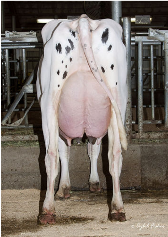
SIEMERS TRJ BROOKE 28046

L-R SIEMERS TRJ BROOKE 28046, SIEMERS TRJ BROOKE 28030, SIEMERS TRY BROOKE 28066