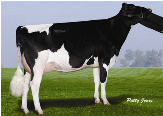
WHITTIER-FARMS HE REBECA FOURTH DAM