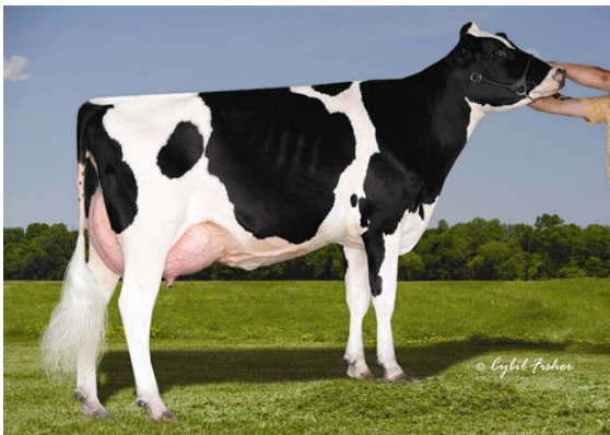
CHERRY CREST MANOMAN ROZ THIRD DAM