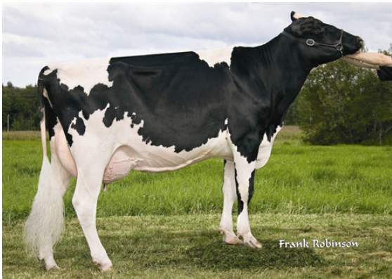
GEN-I-BEQ CHAMPION BAMBI THIRD DAM