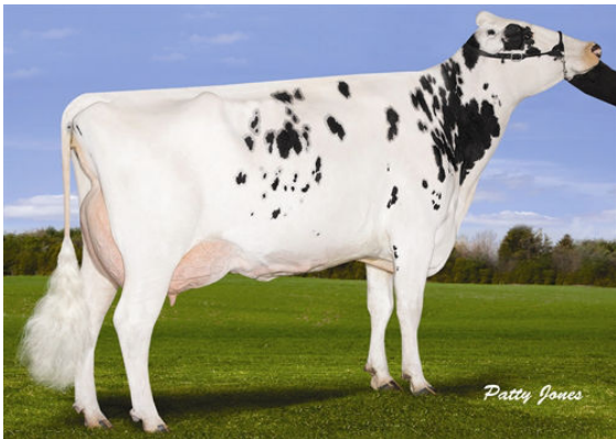
GEN-I-BEQ SHOTTLE BOMBI GRANDDAM