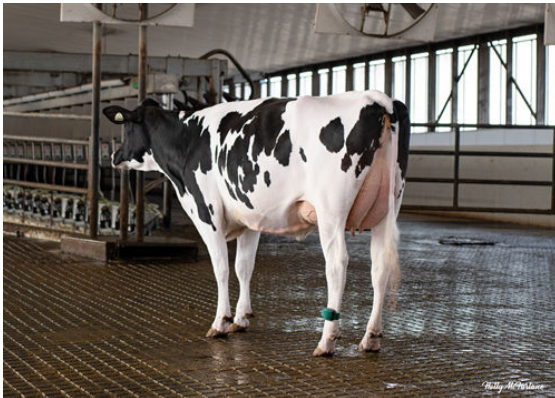
STANTONS FOUNTAIN DRINK