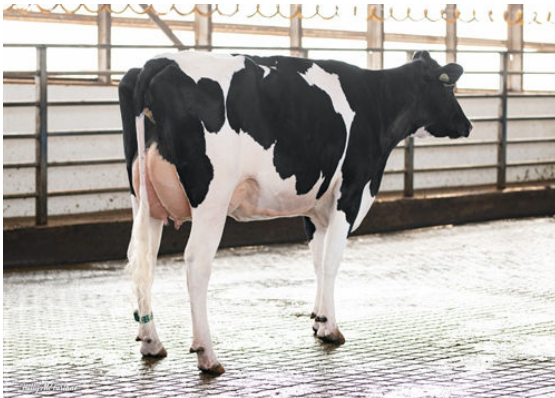
STANTONS FOUNTAIN RESEARCH