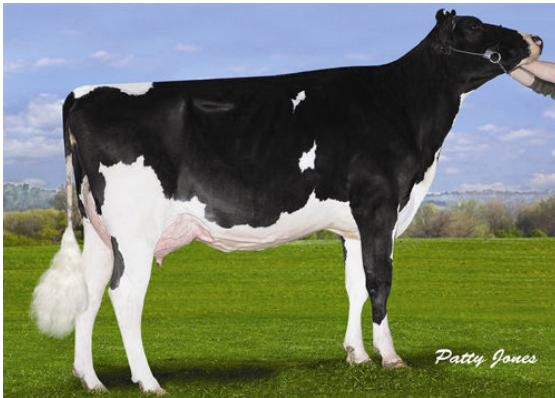
MS LOOKOUT PESK BKM BRIA THIRD DAM