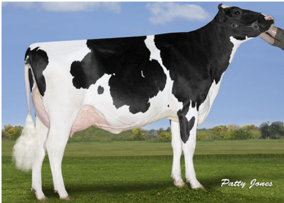
MAPEL WOOD CGAIN LOTTO P DAM