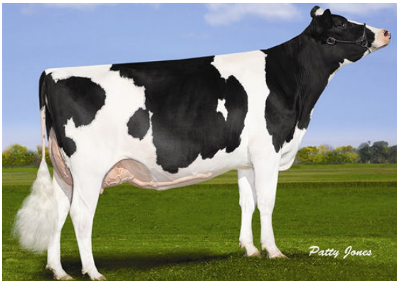
MAPEL WOOD M O M LUCY THIRD DAM