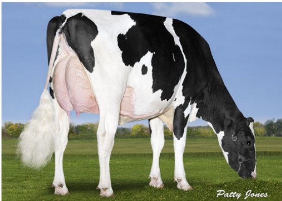
MAPEL WOOD CGAIN LOTTO P DAM