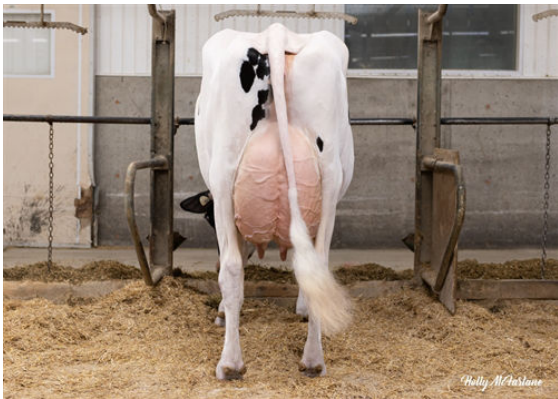
CLAYNOOK ZENA BIGPICTURE DAUGHTER