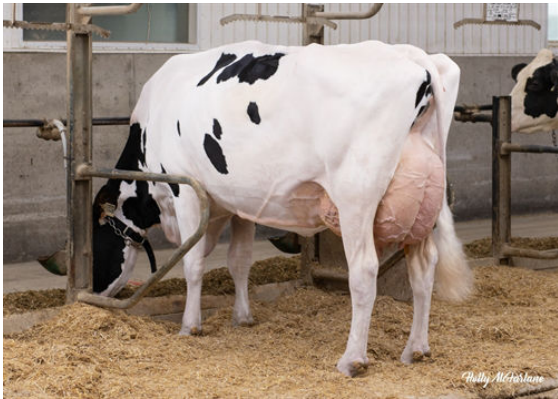
CLAYNOOK ZENA BIGPICTURE DAUGHTER