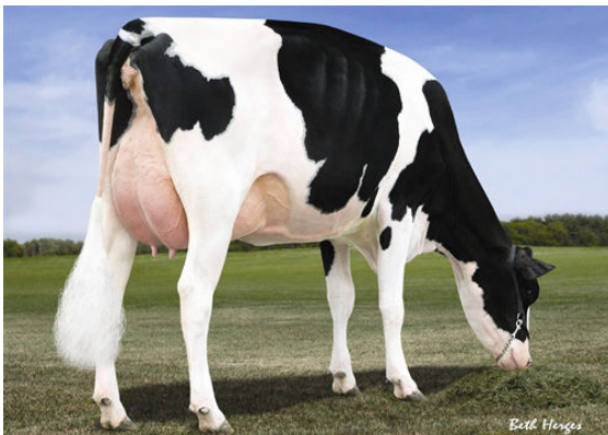
MORSAN MAN D MISSY