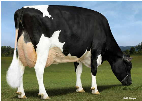
MISTY-MOOR DELTA PAILOU GRANDDAM