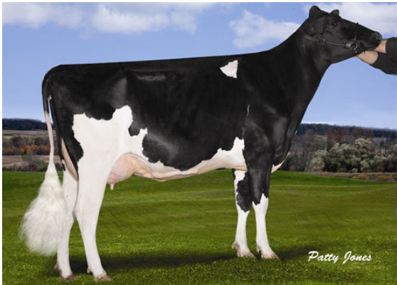
STANTONS FREDDIE CAMEO GRANDDAM