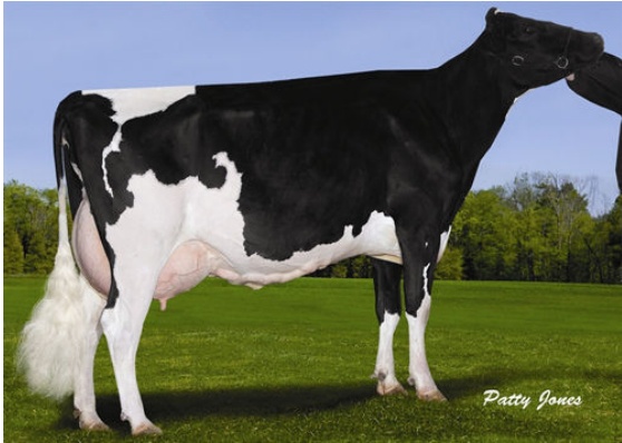
STANTONS LUCKY CAMEO THIRD DAM