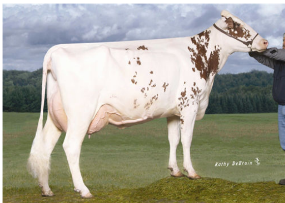
MD-VALLEYVUE CHRIS-RED FIFTH DAM