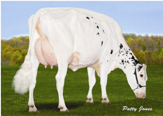
VELTHUIS SG SNOW EVENT FOURTH DAM