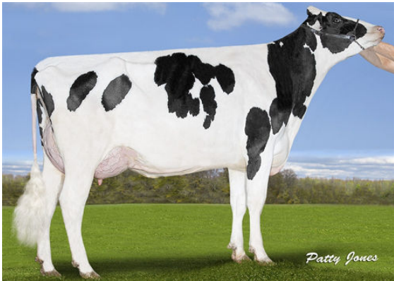
SILVERRIDGE DUKE ELSA-P DAM