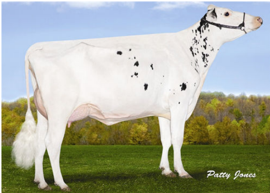
VELTHUIS SG SNOW EVENT FOURTH DAM