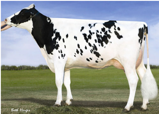
VISION-GEN SH SHO A12037 FOURTH DAM