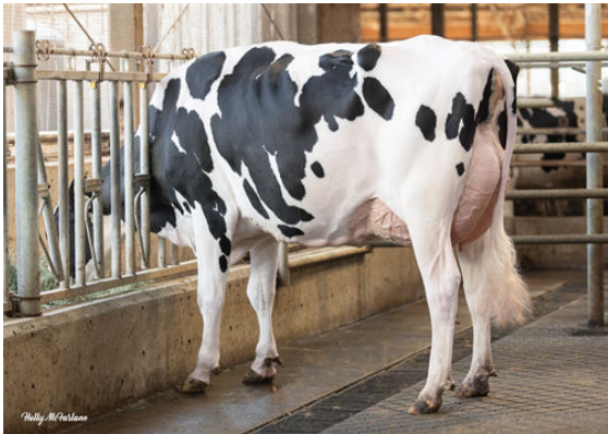
PROGENESIS MANHATTAN PIPER DAUGHTER