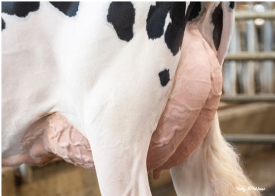
PROGENESIS MANHATTAN PIPER DAUGHTER