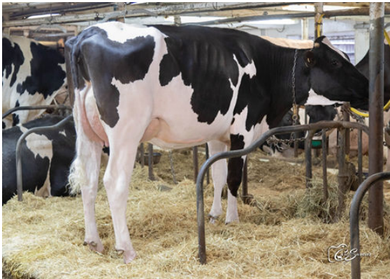
CLOVIS ALLEYOOP INDIANA DAUGHTER