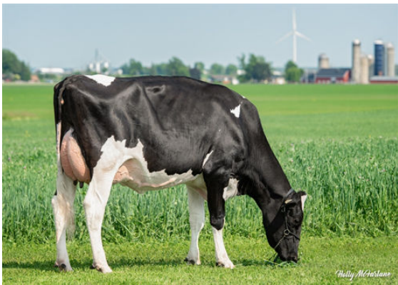
LIBERTY-GEN APPLEFRITTER DAUGHTER