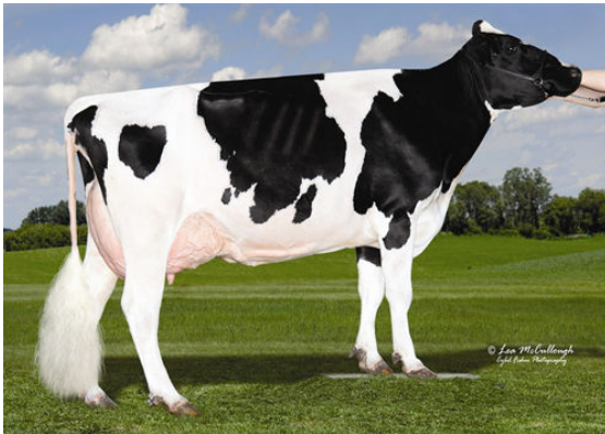
OCD PLANET DANICA FIFTH DAM