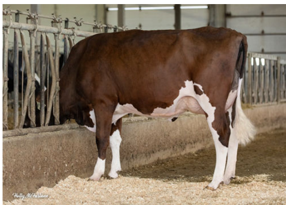
PROGENESIS CHAMPION TIANNA DAUGHTER

GLPI +2926 PRO$ 1277 DPF BKC RDF BLF BYF MWF CVF HH1F HH2F HH3F HH4F HH5F HH6F HCDF HMWF