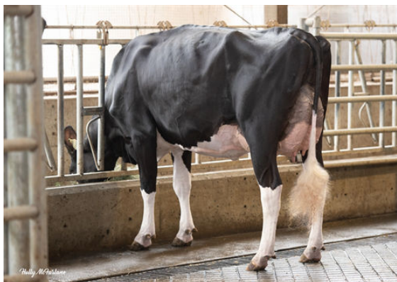
PROGENESIS CHAMPION PALAZZO DAUGHTER

PEAK HOTJOB PROGENESIS GTEE CABERNET RED VG-87-4YR-CAN WESTCOAST GUARANTEE HOLLENDALE JEDI CRIM-RED VG-88-5YR-USA 2* S-S-I MONTROSS JEDI RI-VAL-RE TG CRIMSON-RED VG-86-2YR-USA