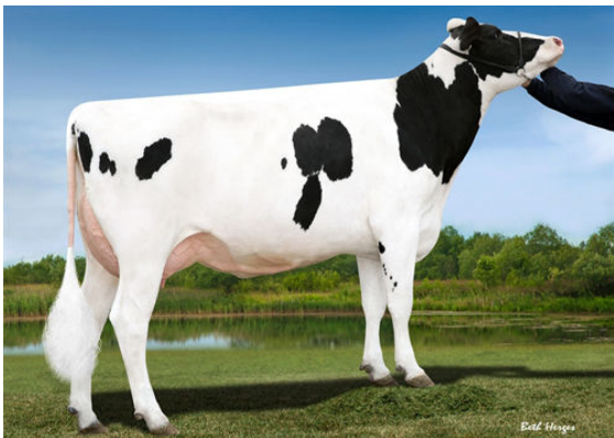
SWAMPY-HOLLOW HOPE THIRD DAM