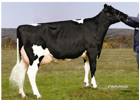
COOKIECUTTER GLD HOLLER FIFTH DAM