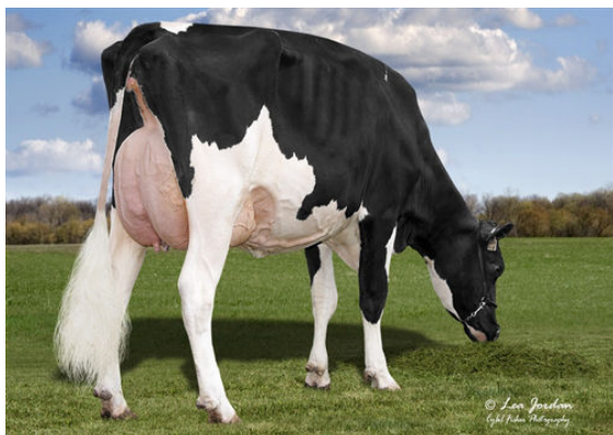
JIMTOWN KD NARCISA DAM