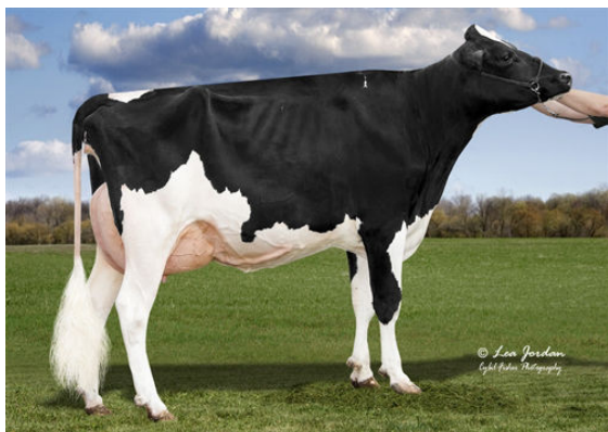
JIMTOWN KD NARCISA DAM