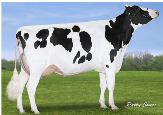
MS FARNEAR MICA MARGARITA THIRD DAM