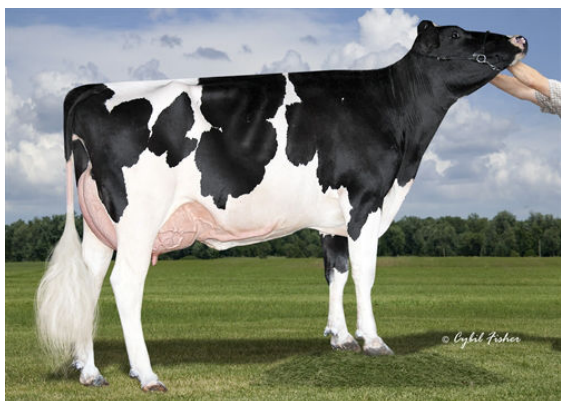
AOT SALVATORE HICCCUP GRANDDAM