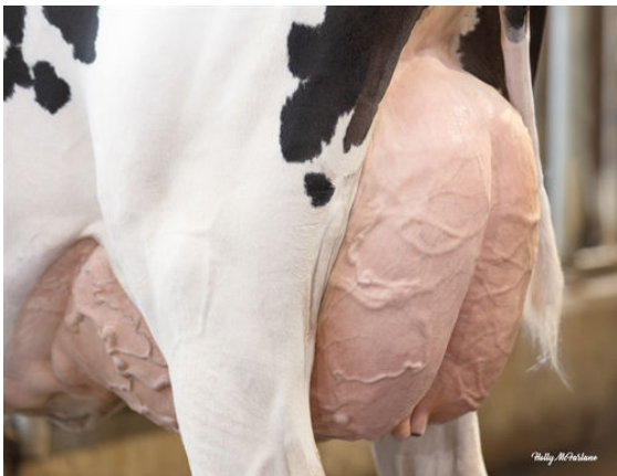
PROGENESIS MIRAND HOTSTUFF P DAM