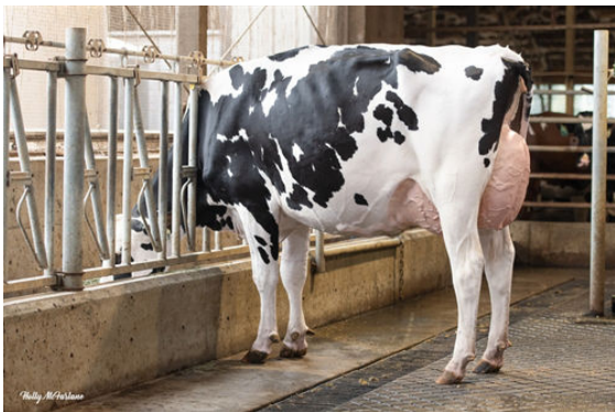
PROGENESIS MIRAND HOTSTUFF P DAM