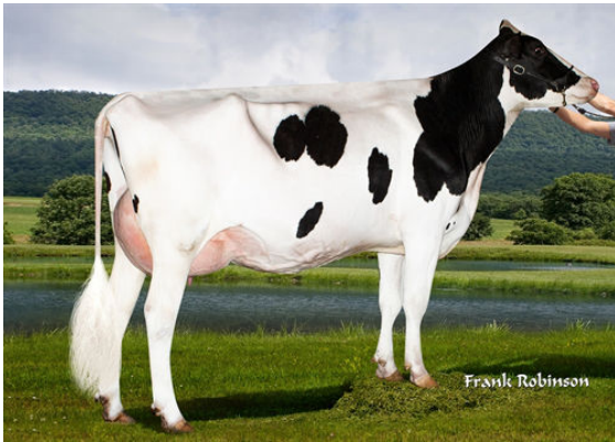
CHERRYPCOL LEE THIRD DAM