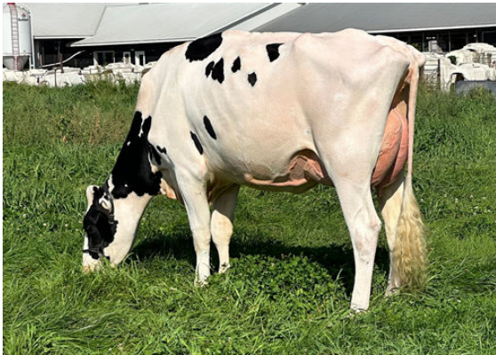
KINGSWAY LAMBDA AZELEA DAM