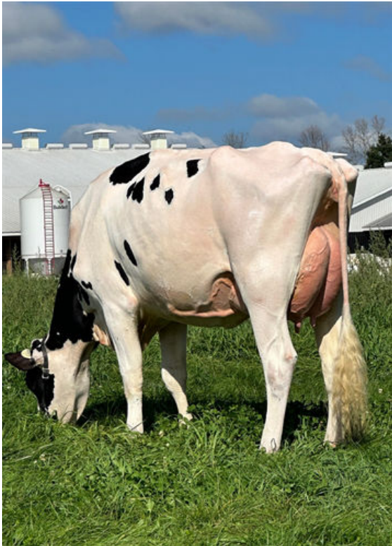
KINGSWAY LAMBDA AZELEA DAM